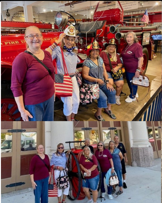
SAN ANTONIO FIRE MUSEUM