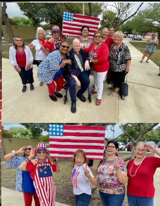
4TH OF JULY AND BIRTHDAY CELEBRATION