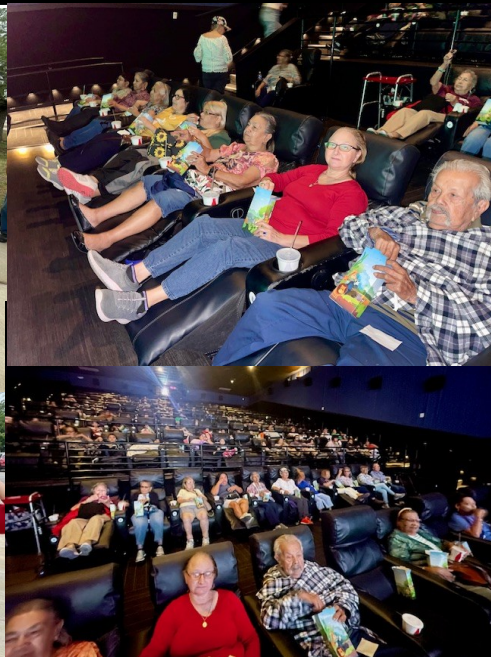
MAYAN THEATER MOVIE