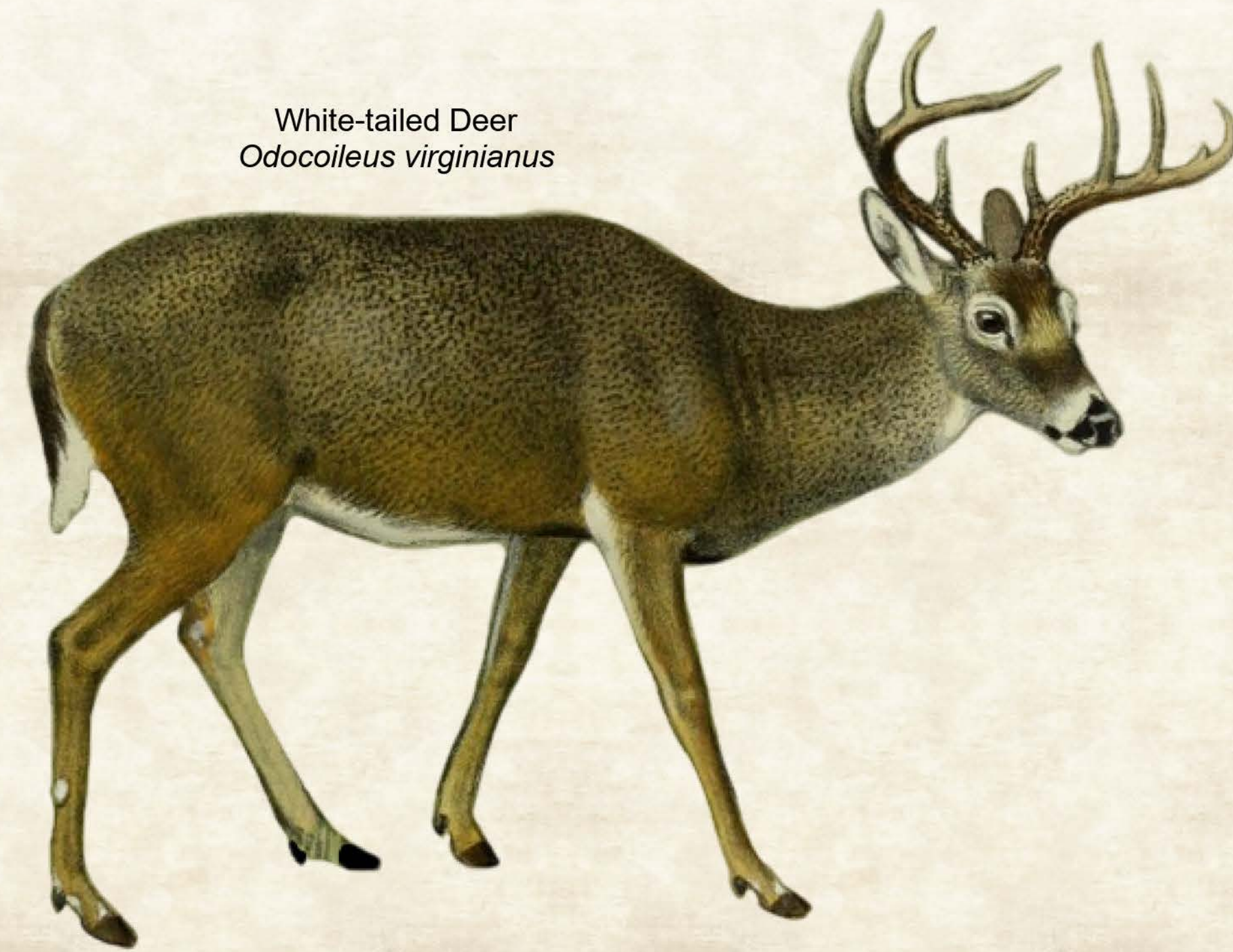
White-tailed Deer Odocoileus virginianus

The GIS data used in this map is for reference and/or informational purposes only and is not intended to be used as legally recorded maps or surveys. The City of San Antonio gives no warranty, either expressed or implied, as to the accuracy, reliability, or completeness of the displayed information.