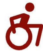
Paved trails meet ADA accessibility standards