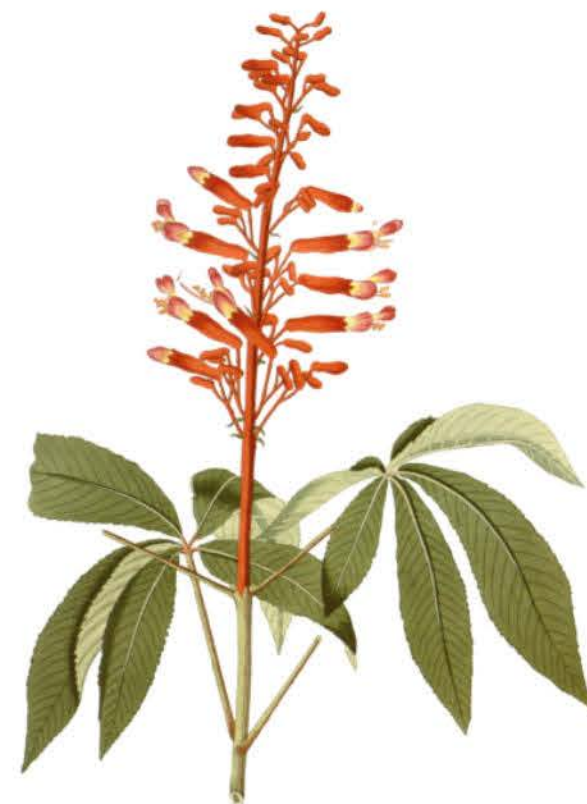
Red Buckeye Aesculus pavia