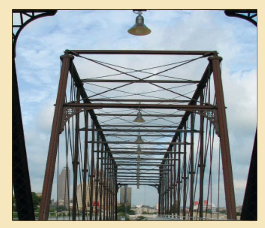
The historic Hays St. Bridge is now a pedestrian and bicycle facility.