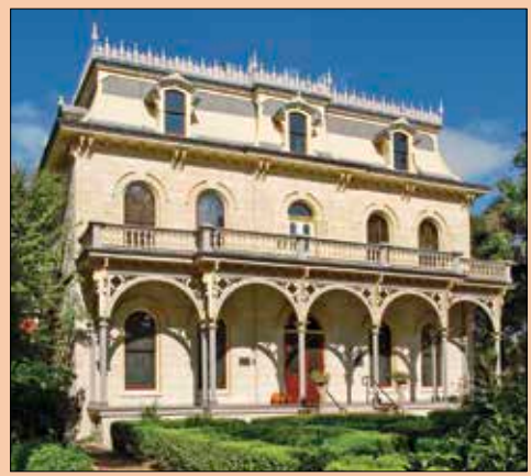
The Downtown/Southtown Route passes by the Steves Homestead Museum, a three-story residence built in 1876.

DISCLAIMER The City of San Antonio does not guarantee the accuracy, adequacy, completeness, or usefulness of any information. Individuals assume all risk and responsibility.