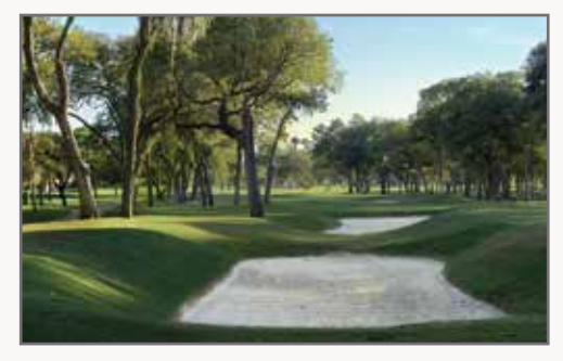
This Brackenridge Park Golf Course was designed in 1915 and is the the oldest 18-hole public course in the state.

As you leave the park, you'll travel along Avenue B, which is a dedicated, family friendly bike path, and then you'll hit Josephine St. which will lead you to N. Alamo St. which will take you back toward downtown.