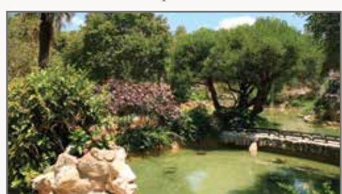
The Japanese Tea Gardens feature beautiful floral displays, a waterfall and a safe habitat for new Koi and aquatic plants.