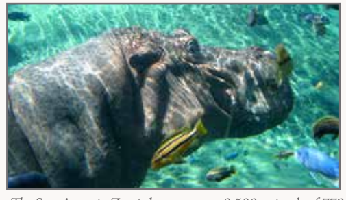
The San Antonio Zoo is home to over 8,500 animals of 779 species and many interactive exhibits. The Zoo is open 365 days a year.