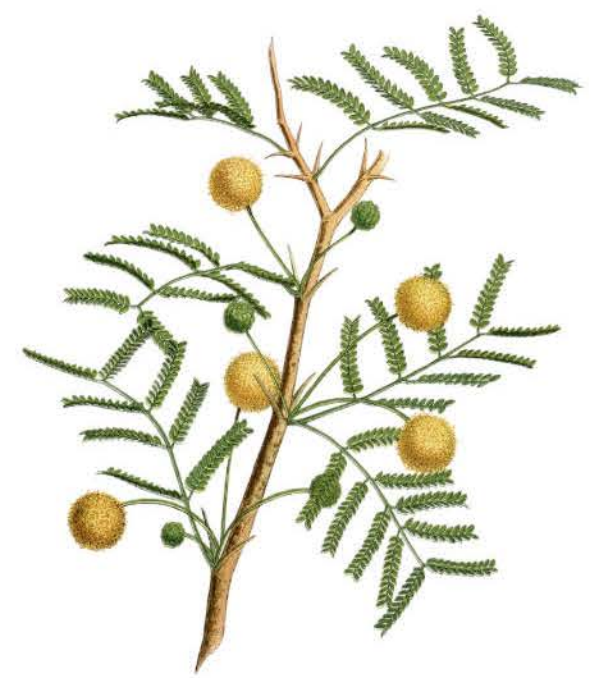
Sweet Acacia Acacia farnesiana