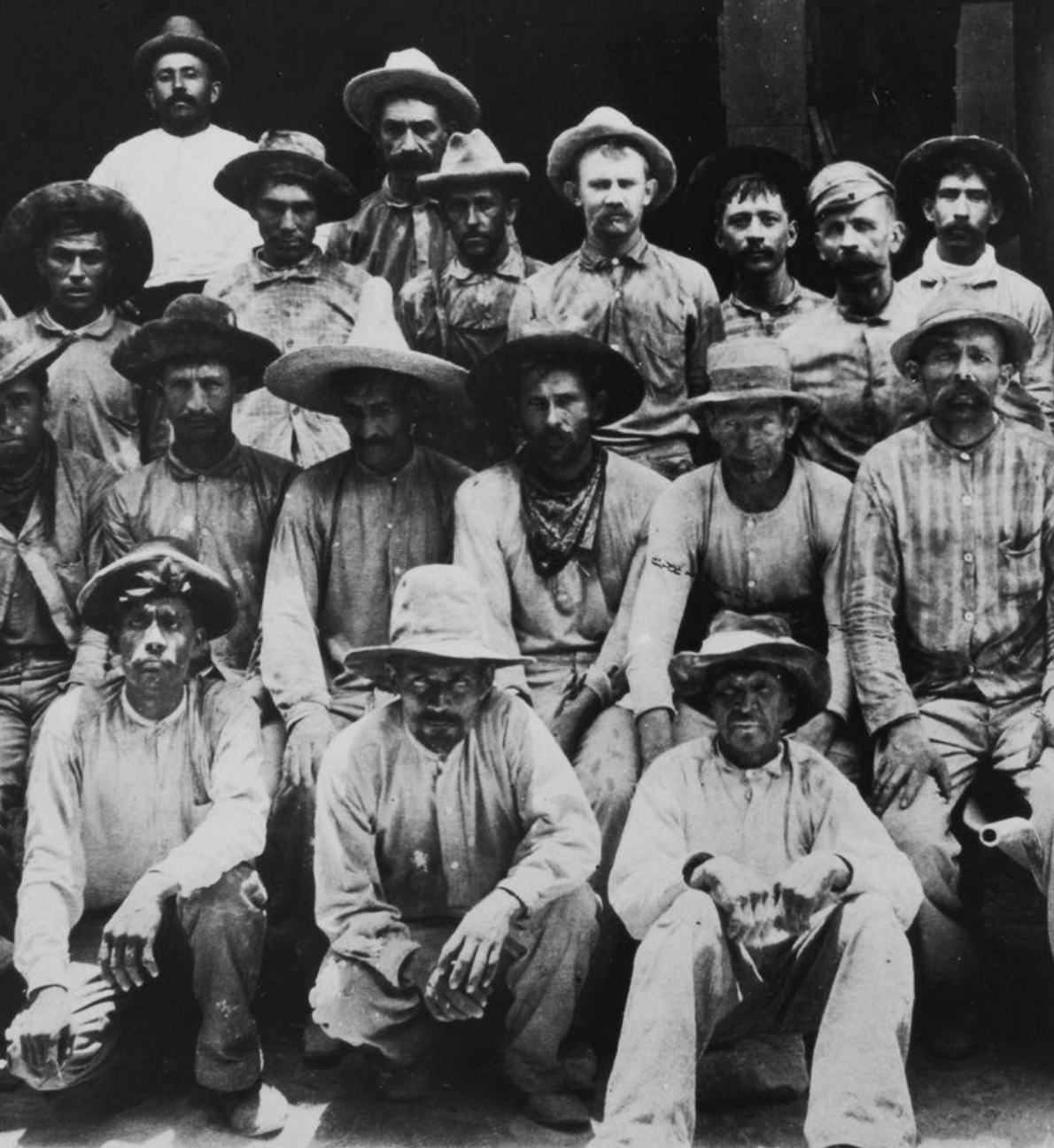
EMPLOYERS OF THE PLANT OF THE (OLD) ALAMO COBENT CO