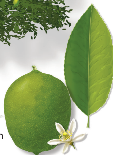
Illustration © Robert O'Brien

Recommended Varieties for the San Antonio Area: Persian